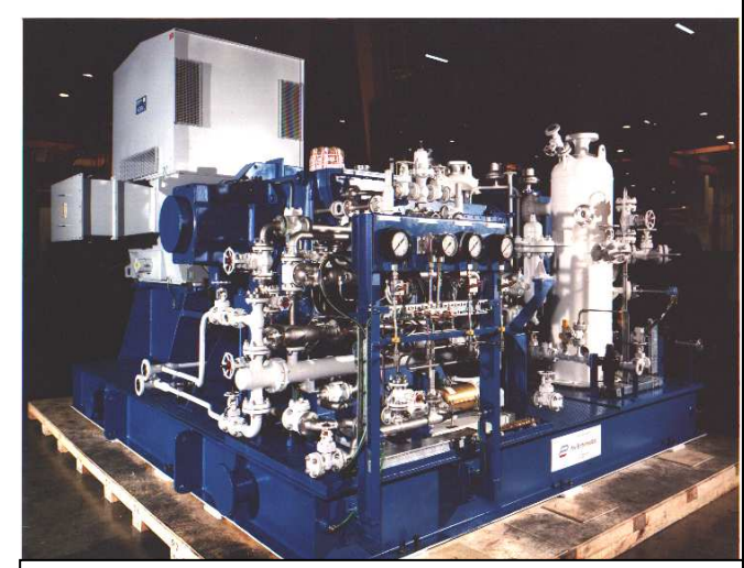
Compressors can be retrofitted with the new system with minimal disruption to operations

This measuring method is a well-proven technique; equipment to do this has been available for many years. The new system is different in that the probe used has a dramatically increased measurement range, which allows a different monitoring philosophy to be utilised.